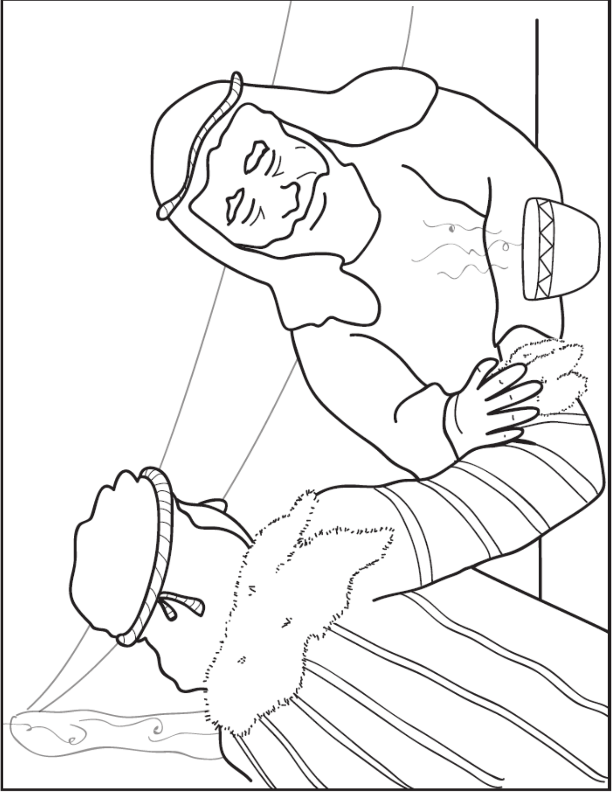
Isaac blessing Jacob instead of Esau