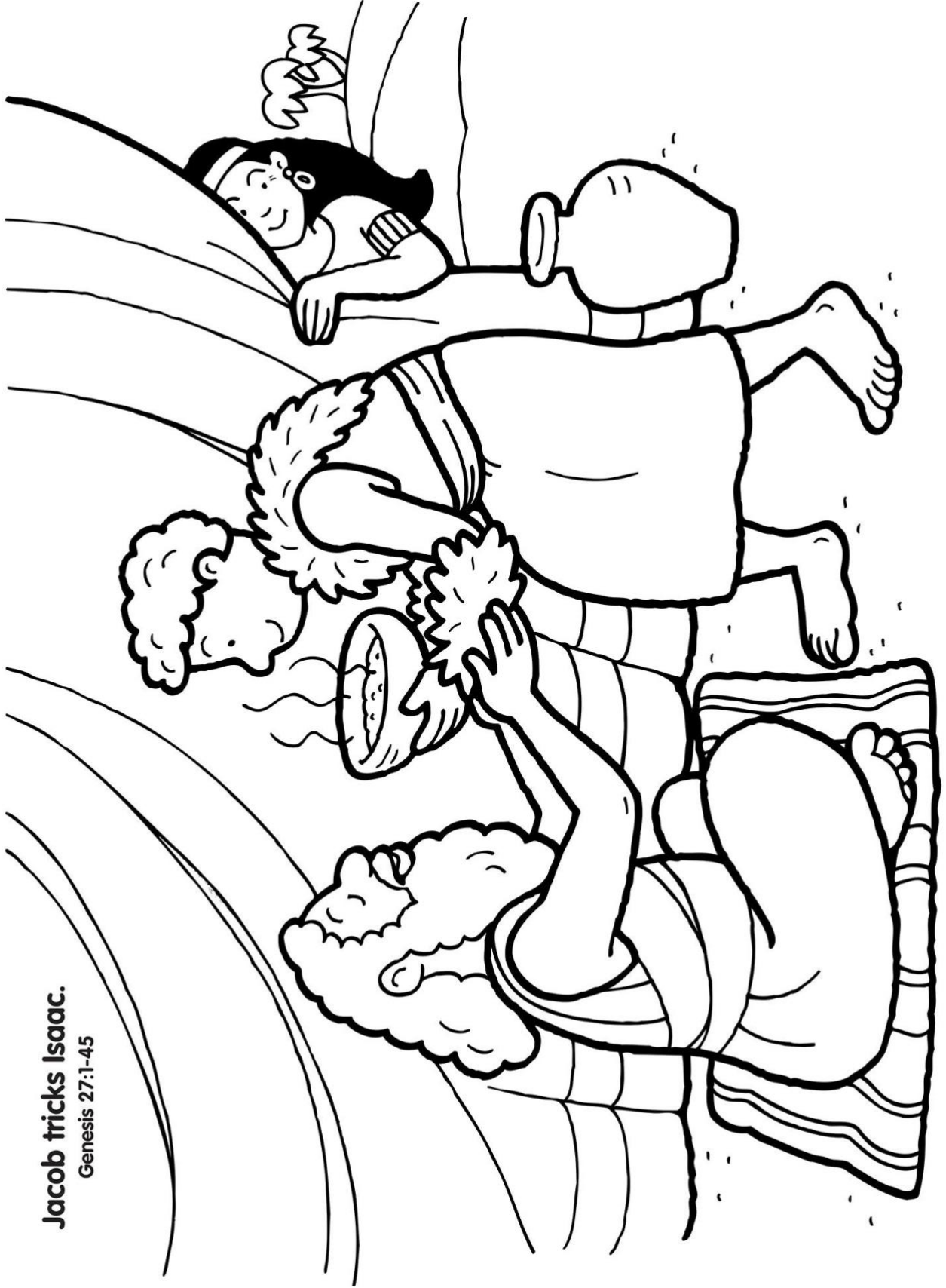
Jacob tricks Isaac. Genesis 27:1-45