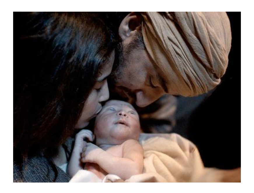
Here we are thankful to God! How we love our new baby boy!

That night Mary gave birth to a baby boy, just as the angel had said! We called our special baby, Jesus, which means God saves.