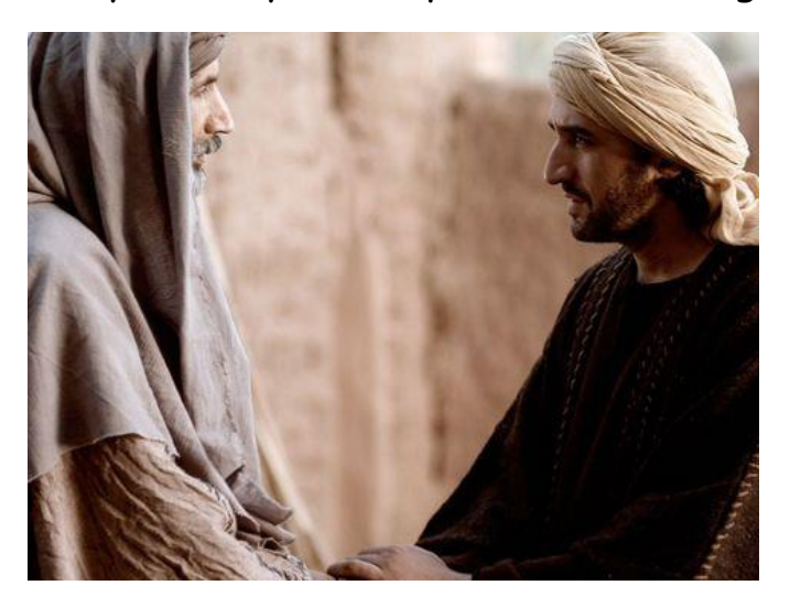
Here is me with Mary's dad.

When I woke up, I decided I should do what the angel had told me to do. So, I went to see Mary's family to complete our marriage agreement.