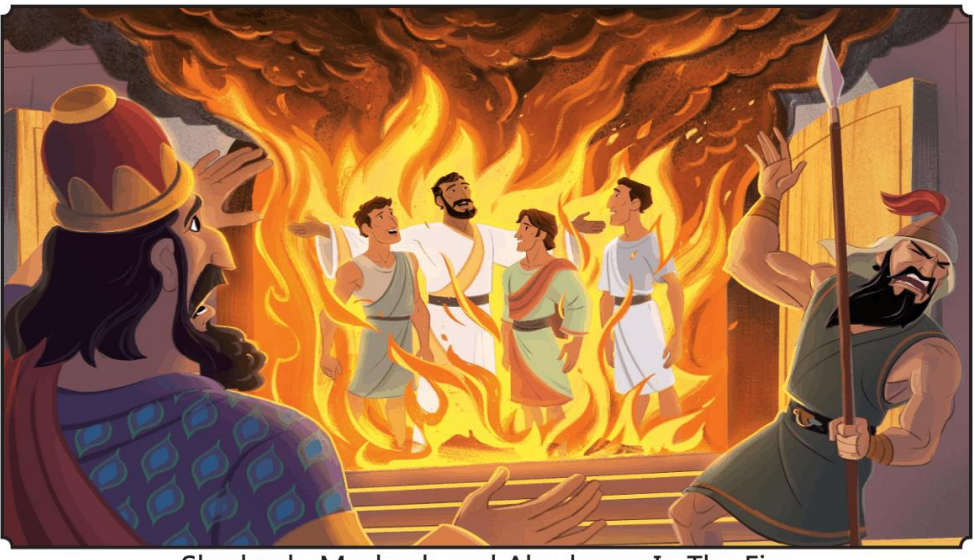
Shadrach, Meshach and Abednego In The Fire

He built a golden statue of himself and ordered everyone to worship it or be killed in a fiery furnace! Some spies told the king that Shadrach, Meshach and Abednego were not obeying the king. Should they have obeyed the king and worshipped the statue? No, they were right to only worship the true God! They were also very brave!