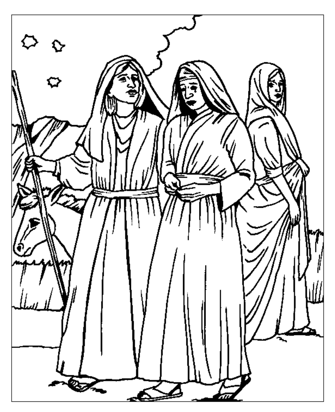
RUTH AND NAOMI

Scripture: Ruth 1 Memory Verse: Ruth 1:16